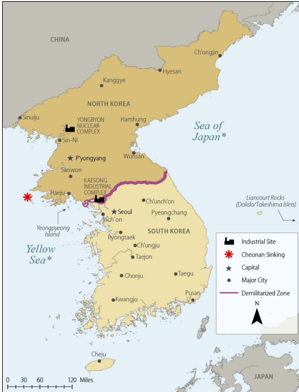
Figure 2. Map of the Korean Peninsula